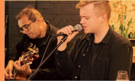
PEACH TREE DREAMERS